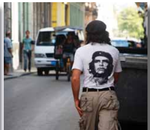
Above is photo taken on the streets of Havana