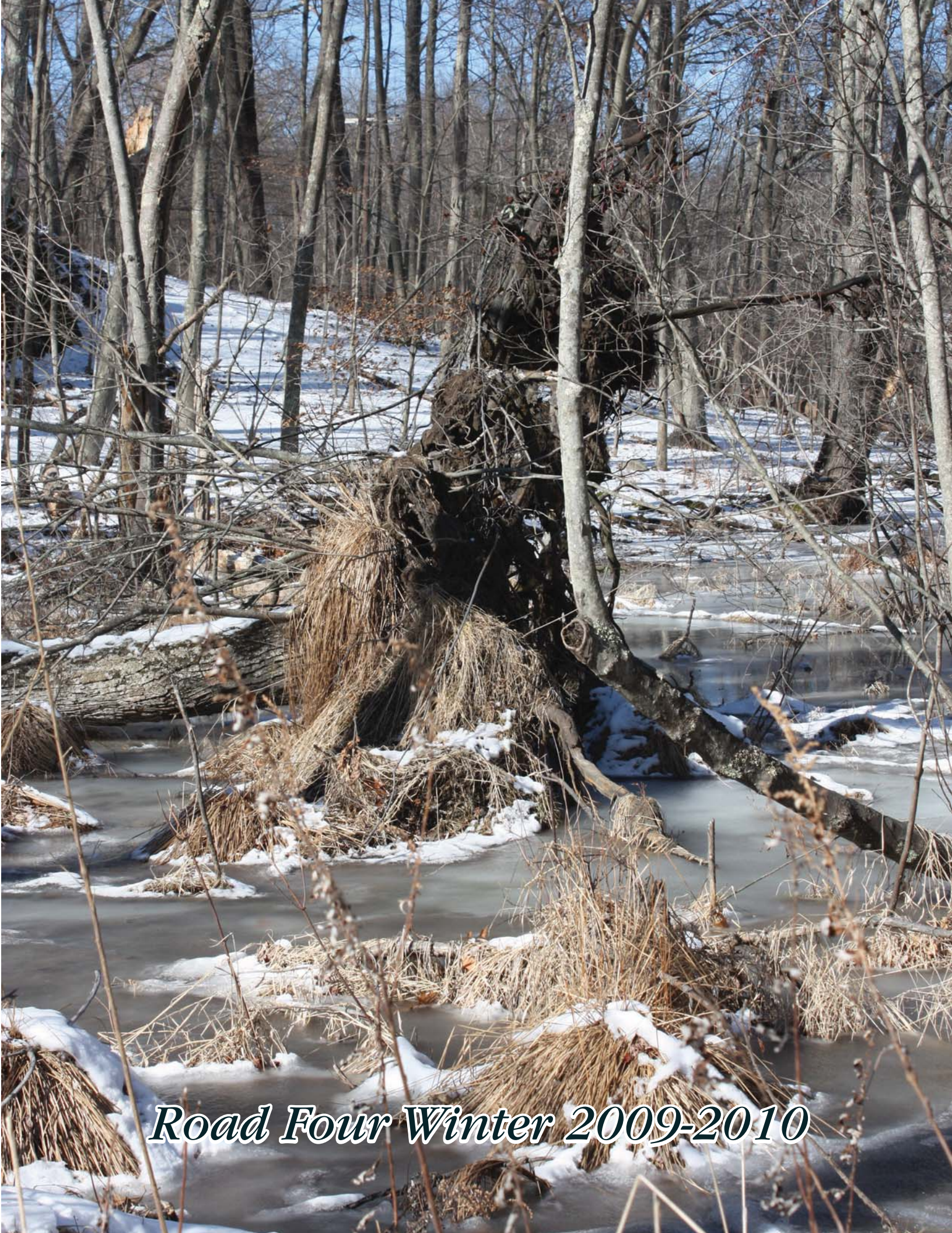
Road Four Winter 2009-2010